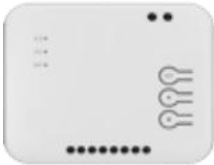
Air conditioner external gateway