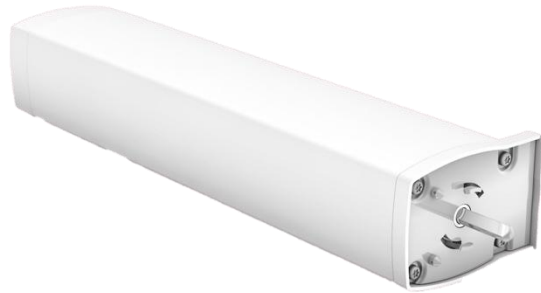
Smart Curtain Motor