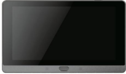
Background music host