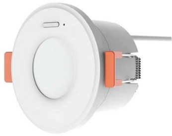
Smart Body Sensor