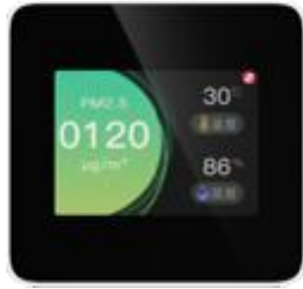
Smart Air box