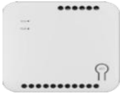
Air conditioner gateway