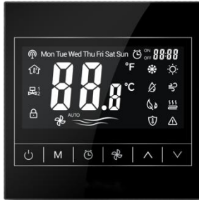
Smart Thermostat Panel