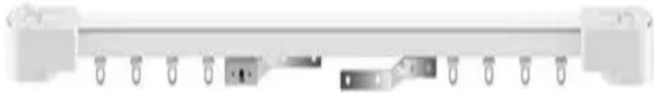
Super Quiet Curtain Track